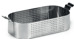
Perforated stainless steel basket