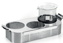
Beaker holder 3 x 0.6 L