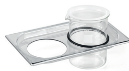
Beaker holder 2 x 0.6 L