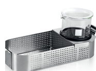
Beaker holder 1 x 0.6 L